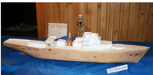
The ship takes form . . .

2010 will mark the 100 th anniversary of the founding of the Royal Canadian Navy, and the Museum has commissioned a custom built model of HMCS St. Thomas to mark the occasion.