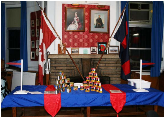
The Prime Ingredient awaits the competitors.