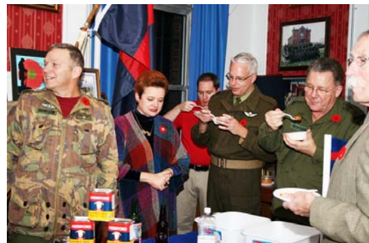
No they are not eating their own.