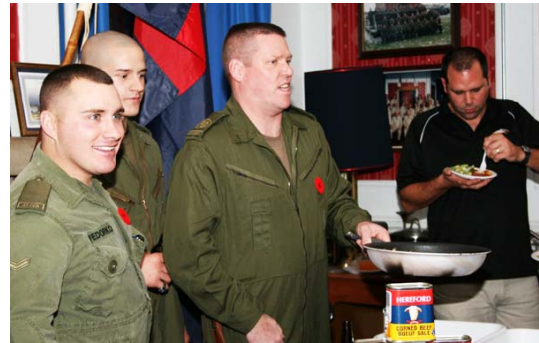
Could we interest you in some lunch?