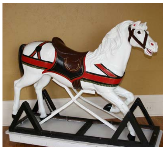
'Hannibal', an original carousel horse that stood for many years in Raven's Shoe Store, has been loaned to the Museum to add to the summer Jumbo display.