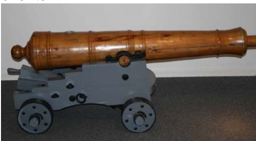
The Barrel 'positive' sitting on the new oak carriage. A new lightweight carriage is to be built for the wooden barrel.

Originally built in 1983 at the Cannon Foundry in St. Thomas the cannon has guarded our entrance and become one of our logos. Recently, the original wooden 'positive' (from which the mould is made) was donated to the Museum. The wooden cannon has drawn so much response from visitors that plans are afoot to build another, lighter carriage for the 'positive' that will become a real eye catcher when the museum sets up displays at various events.